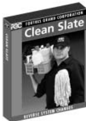
Fortres Grand Corporation